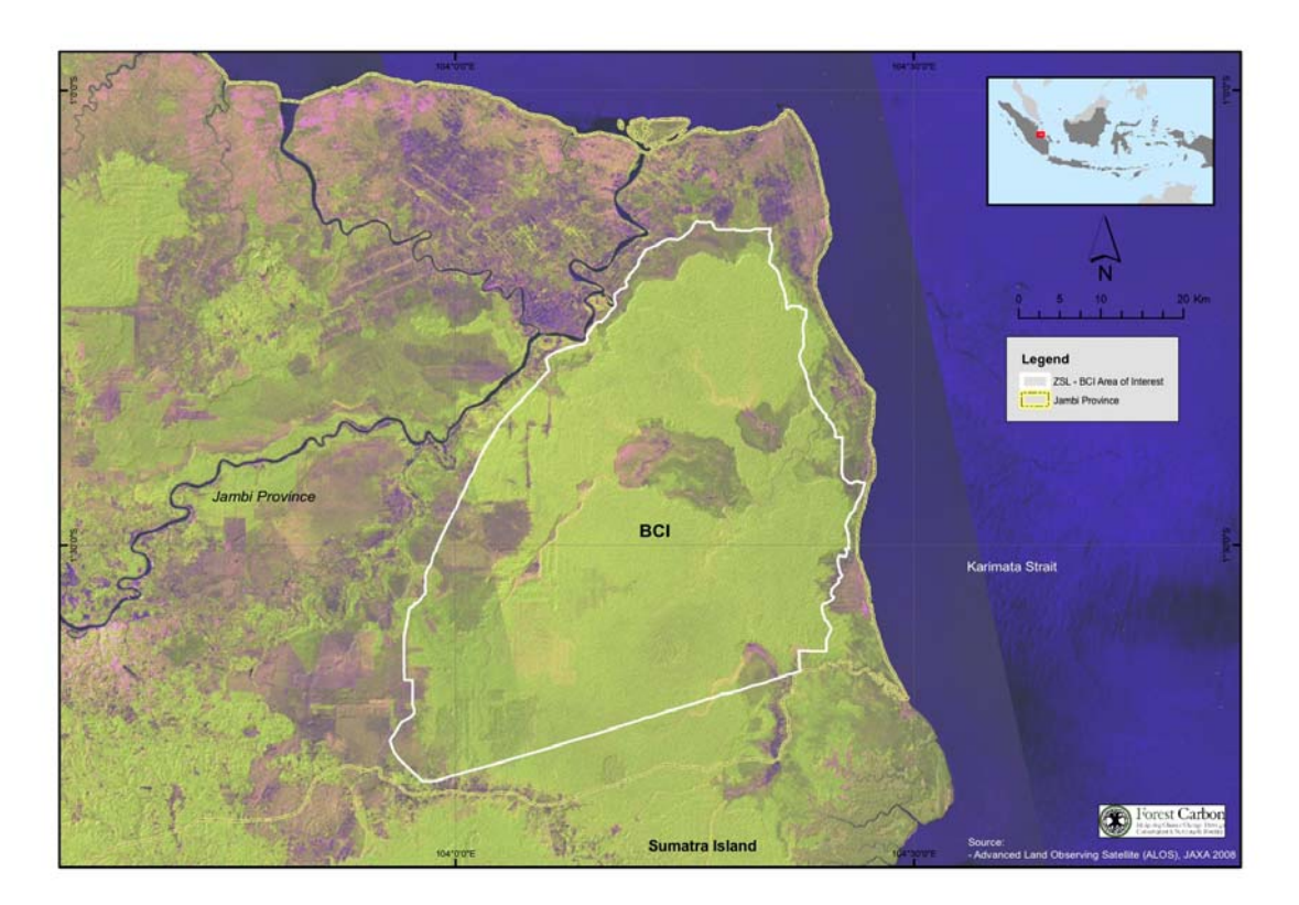
Figure 1 - Location of the ZSL Berbak Carbon Initiative and its constituent forest blocks